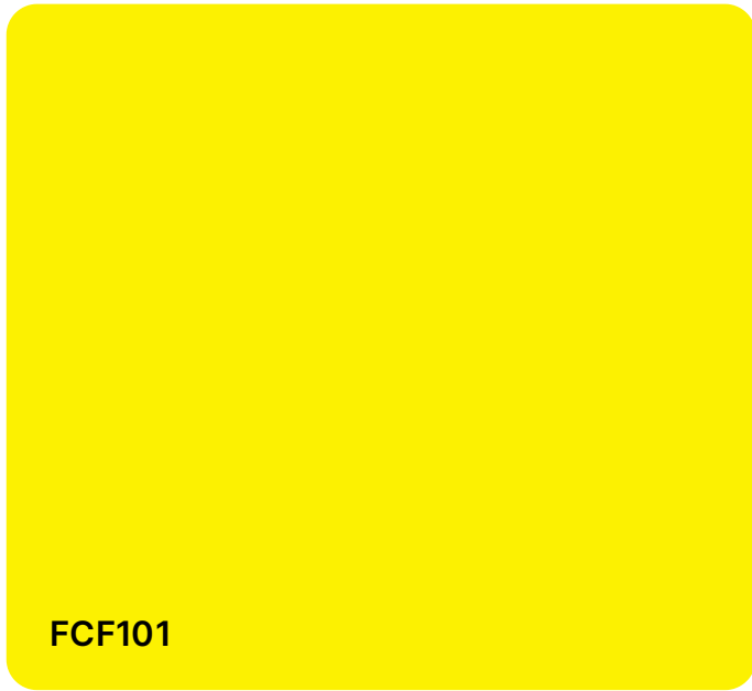
Gintarėlis Logo colour palette